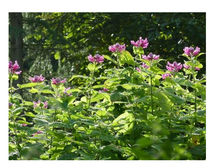
Right: Rosy-leaf Sage, Salvia involucrata

Also along this border, look for the strange deep blue hooded flowers of Strobilanthes attenuate ( Left Below ), growing on rounded bushes with dark green hairy leaves. This is a plant from northern India and Nepal with a long flowering period.