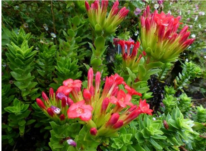
Left: Zoned Pelargonium, Pelargonium zonale