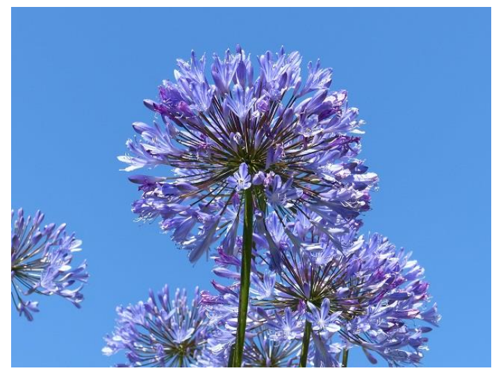
Above: African Corn Liliies, Agapanthus praecox and hybrid

The South African Terrace (3) is currently a riot of colour with a huge range of plants in flower. In addition to Agapanthus, there are Pelargoniums, Osteospermums, brightly coloured Arctotheca daisies, pink Crinum lilies, Bugle lilies ( Watsonia ), Red-hot pokers ( Kniphofia ) and Crocosmias, each represented by different species and cultivars. These are all South African plants which thrive outside here. Elsewhere, Pelargoniums (or geraniums as we often call them) are generally grown as bedding plants. Here, striking species such as the Zoned Pelargonium, Pelargonium zonale ( Left Below ), the cultivar Royal Oak and scented-leaved pelargoniums grow outside throughout the year. The Zoned Pelargonium is a wild South African shrubby species from which many of the cultivated zonal pelargoniums and hybrids are derived. You can see them on the bank on the left hand side of the path.