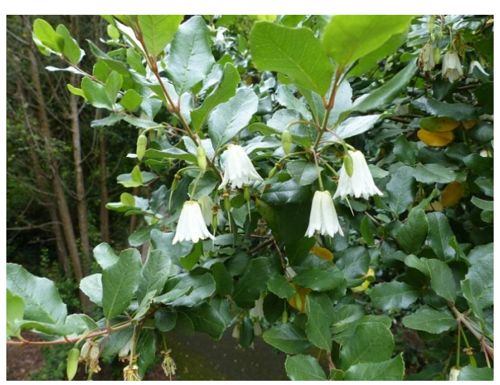
Right: Chilean Lantern Tree, Crinodendron patagua

In the Palm Garden (7) , look for the Red Bolivian Fuchsia, Fuchsia boliviana ( Left Below ). This shrubby fuchsia produces exotic, hanging clusters of four inch vibrant fluorescent red trumpet shaped blooms. It comes from the cool cloud forests of Bolivia and southern Peru. The ancient Incas cultivated this plant and the fruits are still sold in South American markets today. It is generally grown in a conservatory in this country.