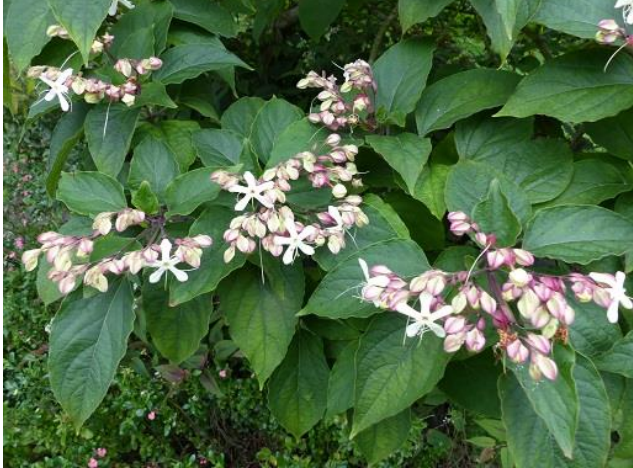
Left: Strobilanthes attenuata