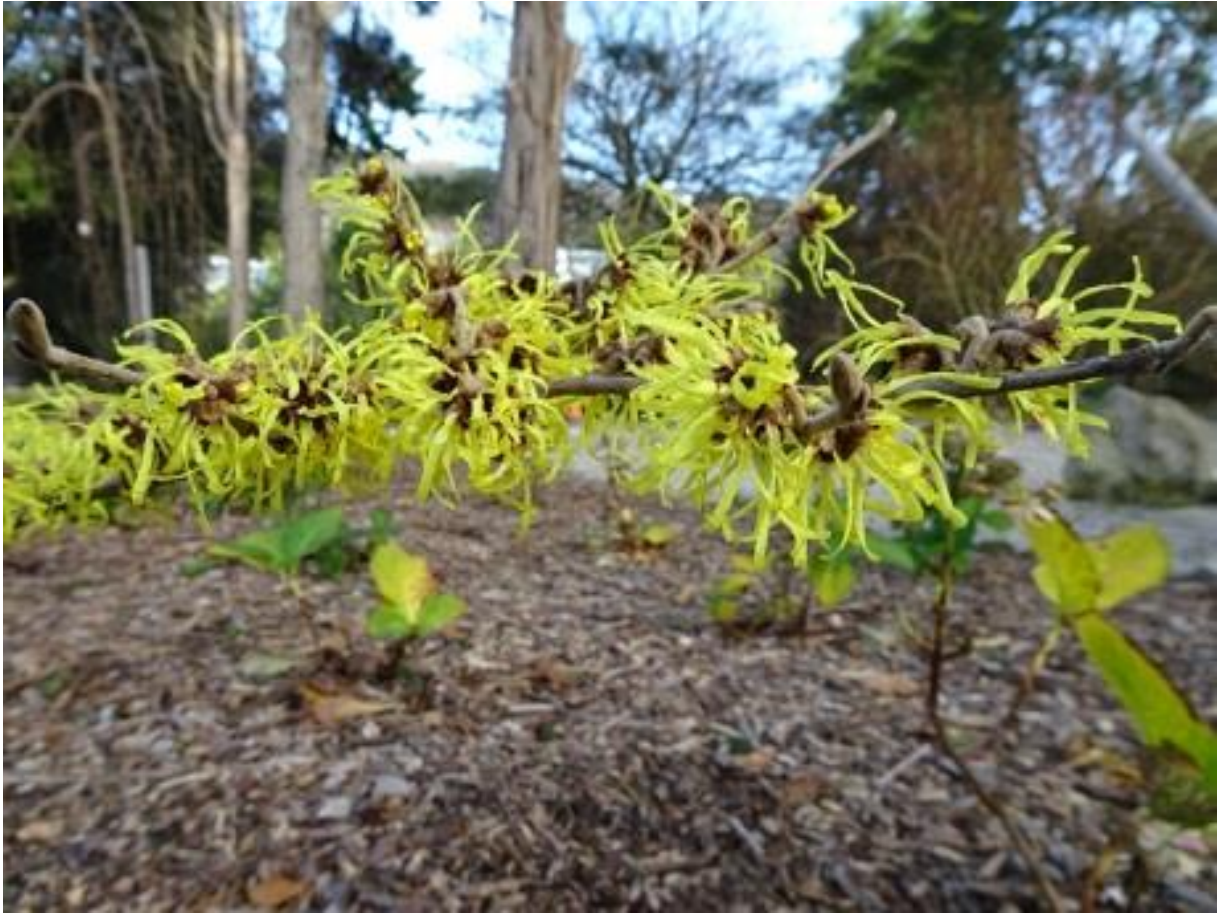
Hamamelis japonica pallida in the Oriental Garden

There is always something new to see here throughout the year and every visit will bring new botanical surprises.