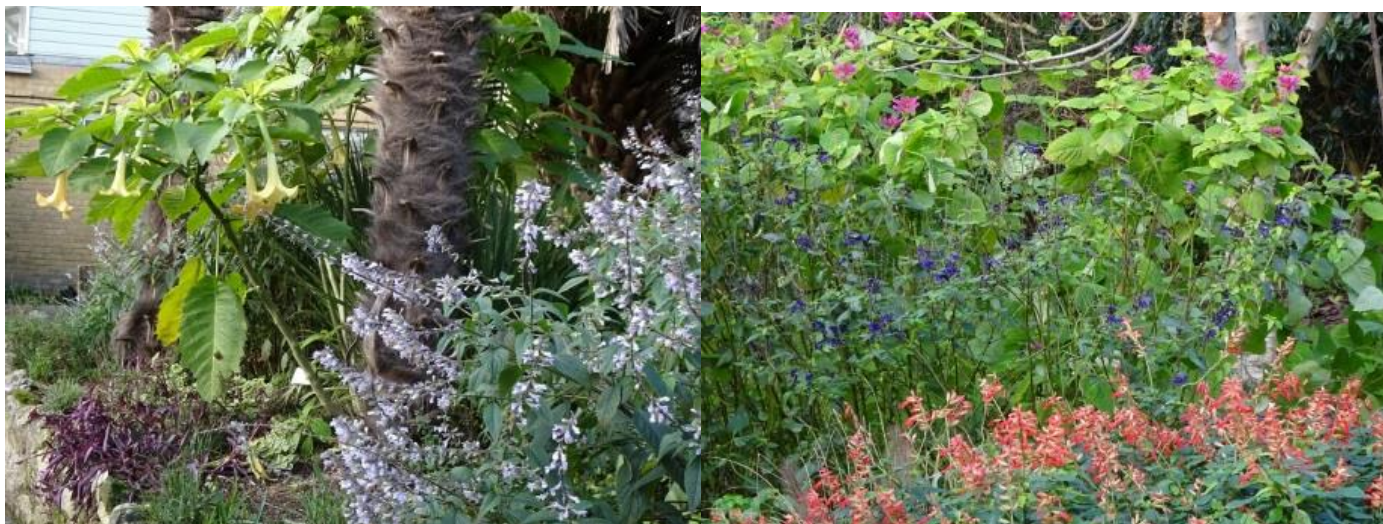
The Botanic Garden flowering in January

The days may be short and the sky overcast but plants are still flowering here in Ventnor. The earliest spring flowers are emerging whilst other plants, such as the shrubby Salvias haven't stopped flowering despite the cold. The annual New Year's Day flower count by the Curator, Chris Kidd, revealed 207 plants in flower in the Garden. This was a higher count than last year although not as high as 2016.