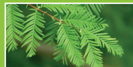
DAWN REDWOOD Hydrangea Dell