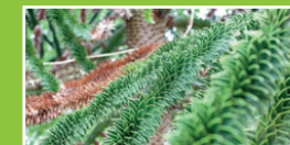
MONKEY PUZZLE TREE Opposite New Zealand Garden towards coastal path