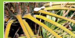
CYCADS Arid Garden