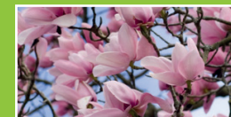
MAGNOLIA Hydrangea dell