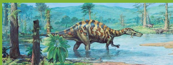
The Isle of Wight in the Early Cretaceous period 125 million years ago

Some of the plants that dinosaurs would have seen are still alive. At Ventnor Botanic Garden you can see some of these 'living fossils'.