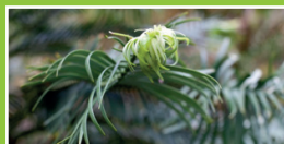
THE WOLLEMI PINE Australian garden