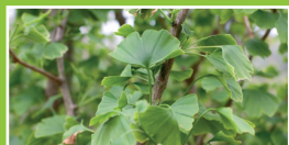
GINKGO TREES Medicinal garden