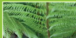
TREE FERNS Australian Garden